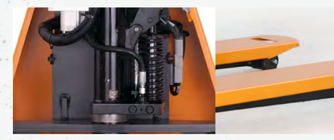
Manually operated pump with quick lift