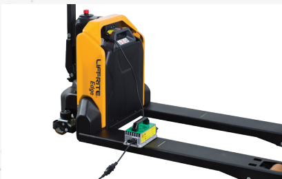
Fast and opportunity charging using a standard 110V outlet minimizes downtime