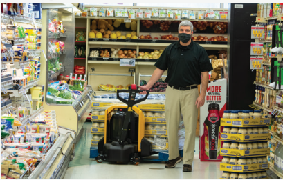
Long run times ensure efficient use of trucks and operators