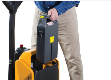
Quick, easy battery changes optimize uptime and productivity