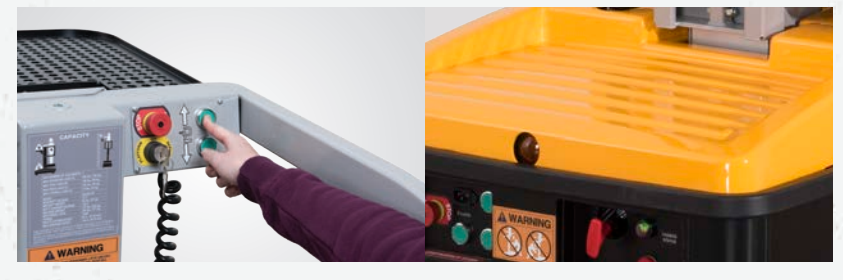
Operator compartment allows easy access to the key switch and lift/lower controls