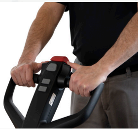
Dual thumb controls offer comfortable operation for left- or right-handed users