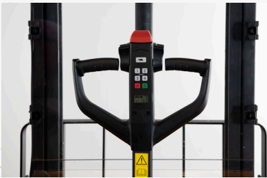
PIN code access requires no key and prevents unauthorized use