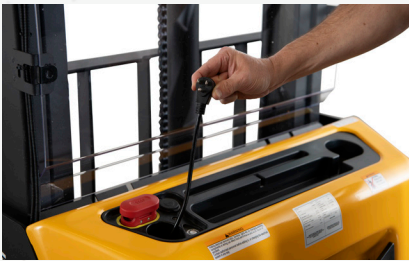
Opportunity charging keeps the trucks on the floor